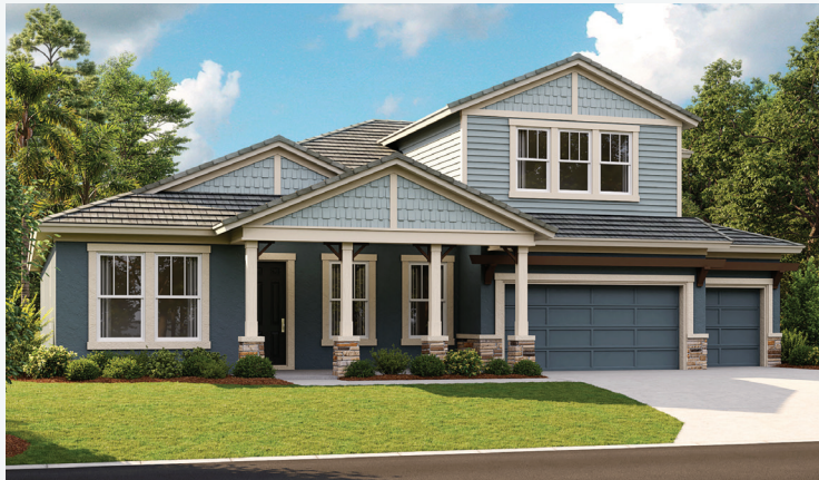
Craftsman B | CRT4