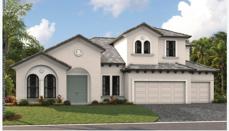
Mediterranean E | FMD4