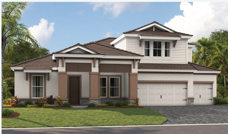
Coastal C | COA13