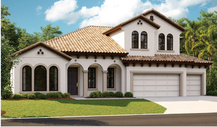
Mediterranean C | FMD3

3,560-3,954 Sq.Ft. | 4-5 Bedrooms 4 Baths | 3-Car Garage