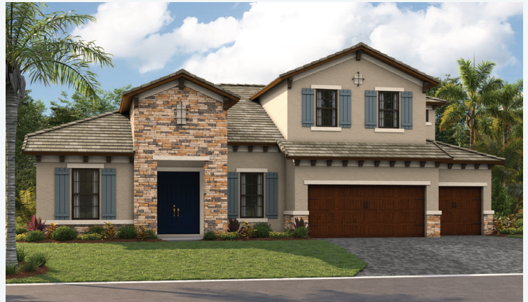
Tuscan A | TUS5