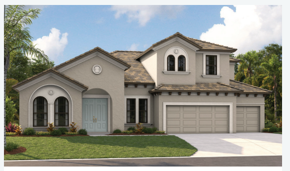
Mediterranean E | FMD9