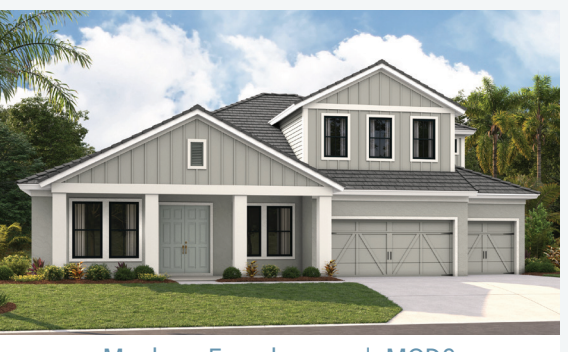
Modern Farmhouse | MOD9