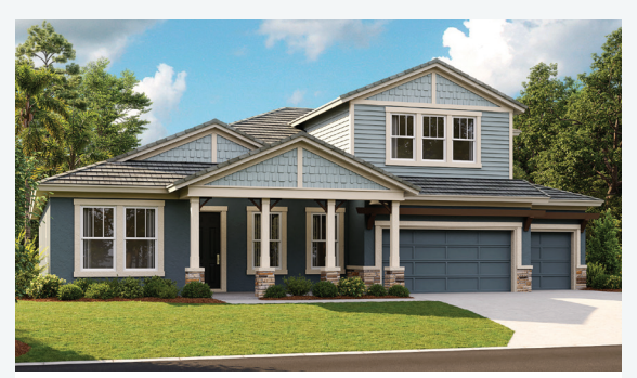
Craftsman B | CRT4