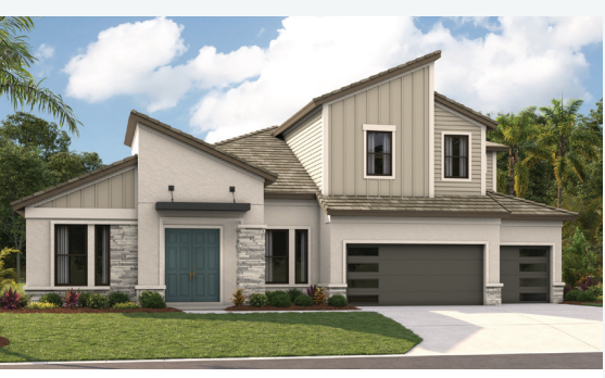
Modern | MOD10