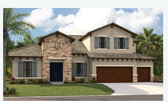
Tuscan A | TUS5