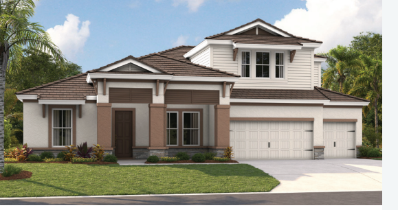
Coastal C | COA13