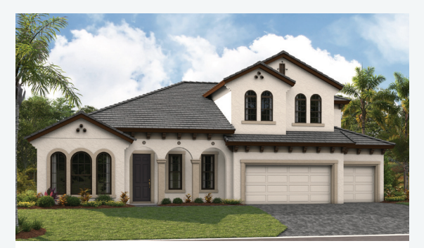
Mediterranean C | FMD3

3,560-3,900 Sq.Ft. | 4-5 Bedrooms 4 Baths | 3-Car Garage