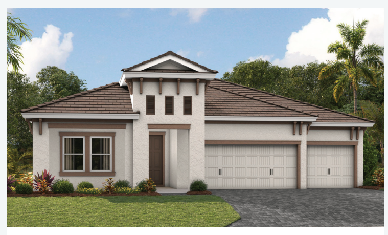
Coastal C | COA13