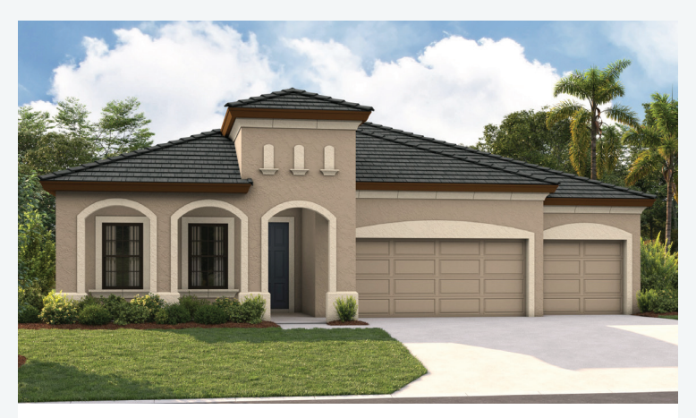
Mediterranean B | FMD8