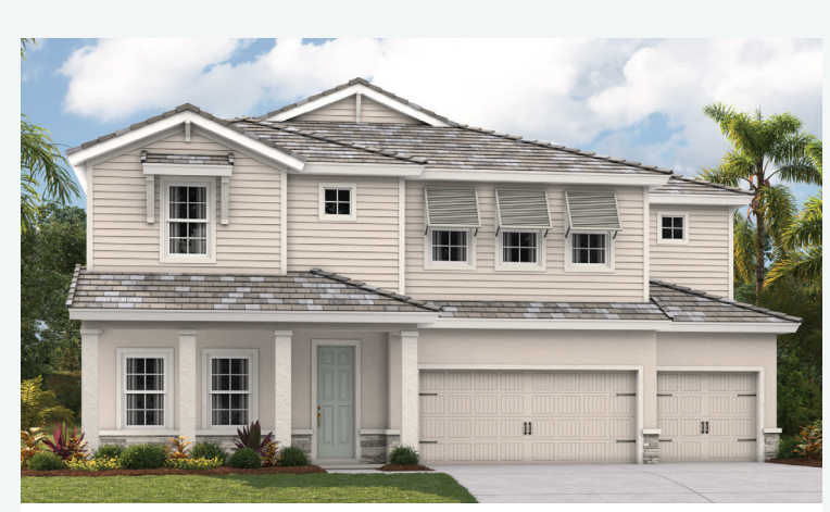
Coastal C | COA6