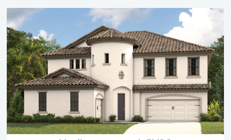
Mediterranean | FMD3