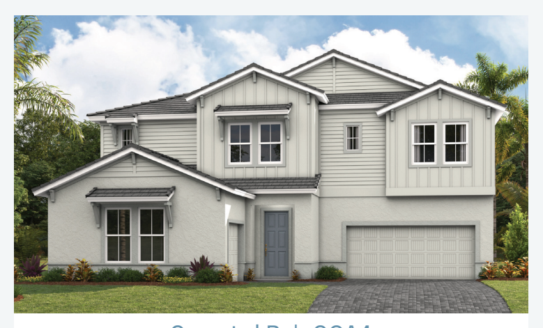
Coastal B | COA4