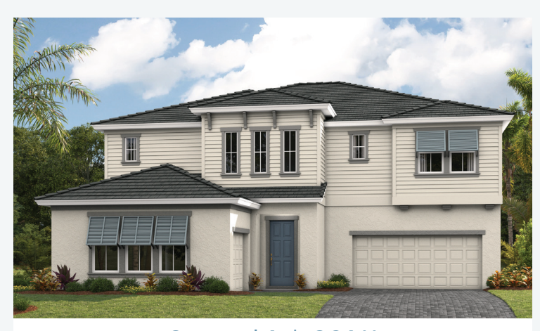
Coastal A | COA11