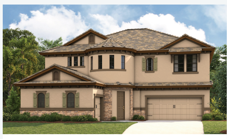
European | EUC4