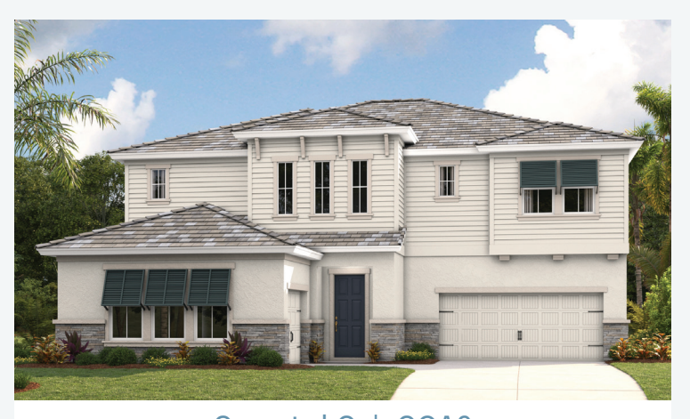
Coastal C | COA9