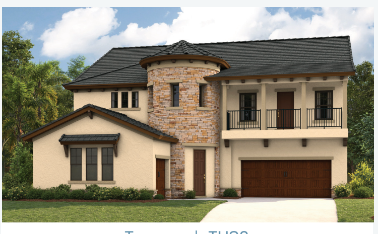
Tuscan | TUS3