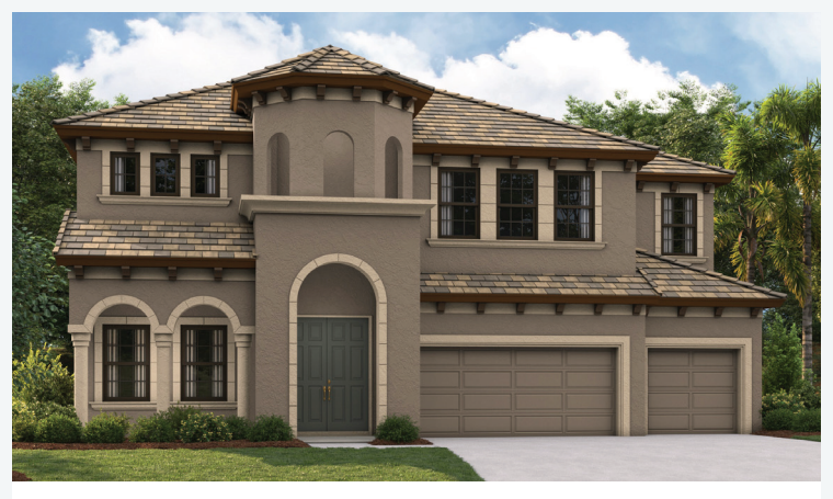
Mediterranean A | FMD2