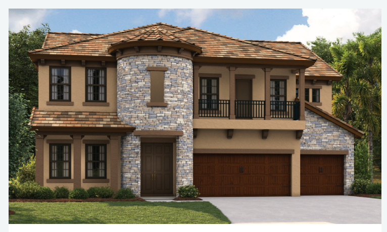
Tuscan A | TUS2