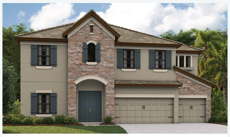
European A | EUC1