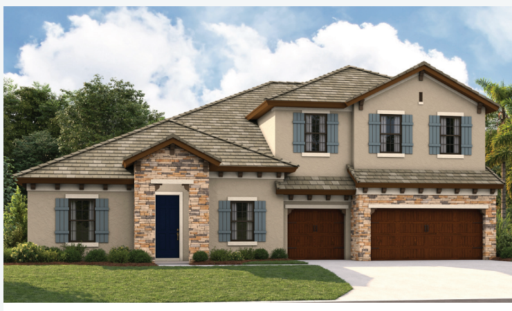
Tuscan A | TUS5