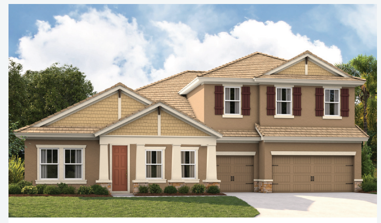
Craftsman A | CRT3