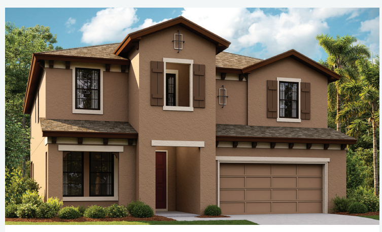
Mediterranean A | FMD5