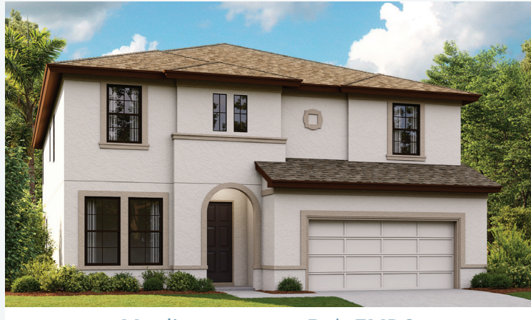
Mediterranean B | FMD3