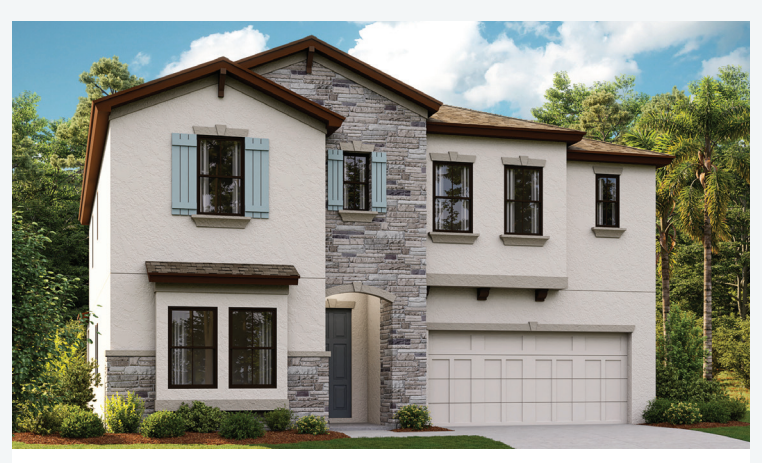
European A | EUC6