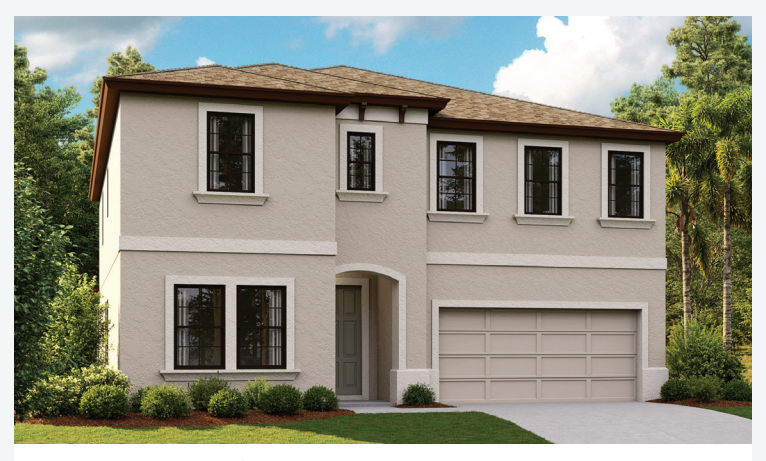
Mediterranean A | FMD6