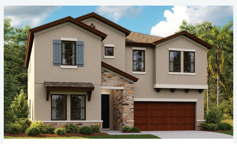
Tuscan A | TUS5