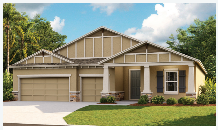
Craftsman A | CRT1