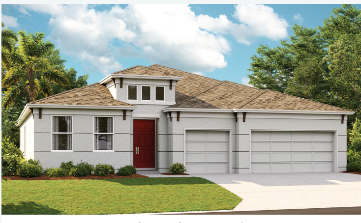
Regional Modernist | REM5