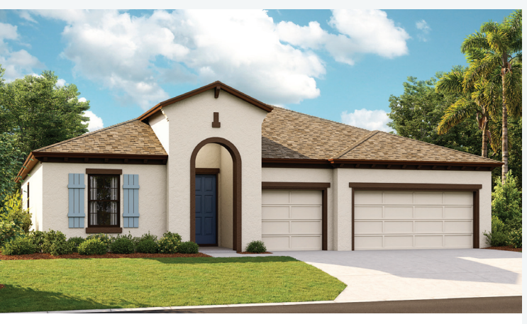
Mediterranean A | FMD4