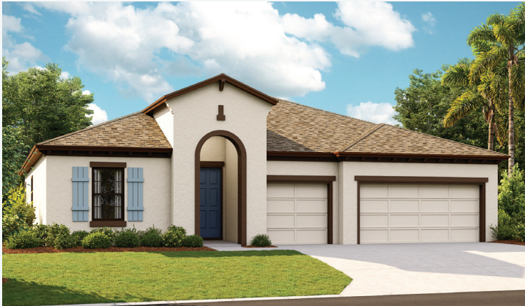
Mediterranean A | FMD4