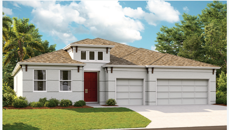
Regional Modernist | REM5