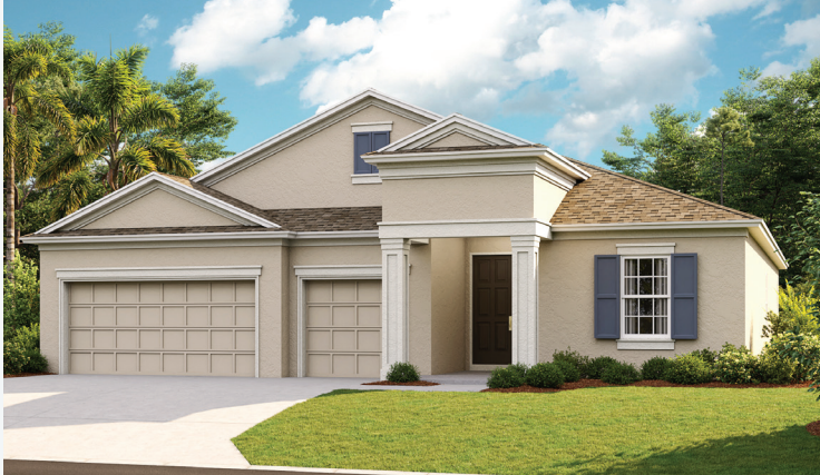
Classical A | CLS2

2,572-2,751 Sq.Ft. | 3-5 Bedrooms 3-4 Baths | 3-Car Garage