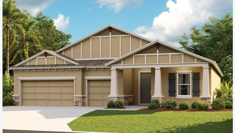
Craftsman A | CRT1