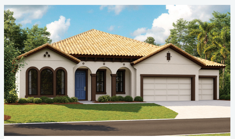
Mediterranean C | FMD4

2,839-3,179 Sq.Ft. | 3-4 Bedrooms 3 Baths | 3-Car Garage