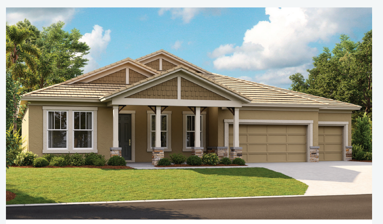
Craftsman B | CRT1