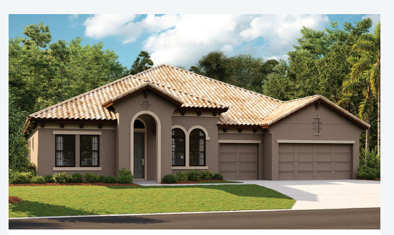
Mediterranean A | FMD2