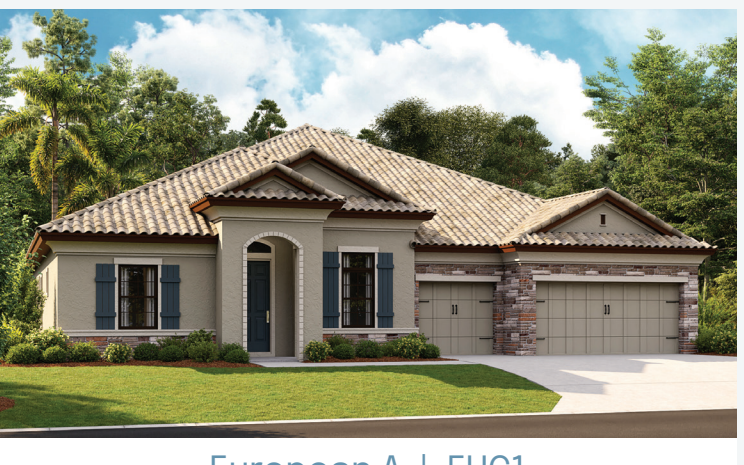
European A | EUC1