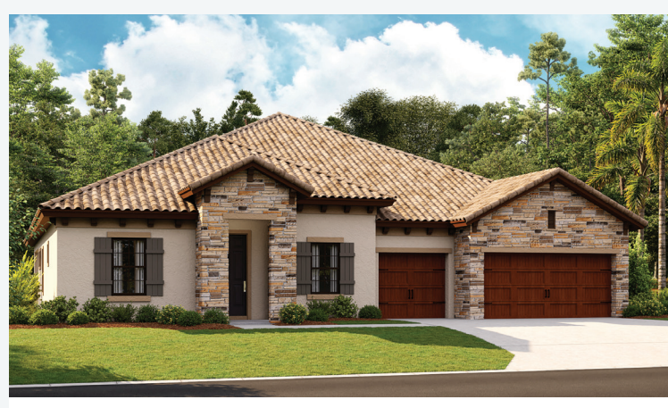
Tuscan A | TUS4