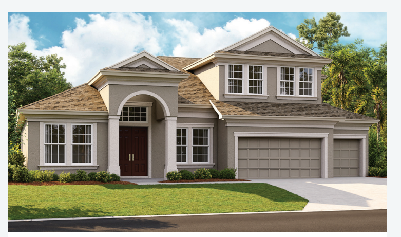
Classical B | CLS1