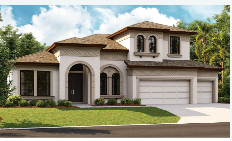
Mediterranean B | FMD3