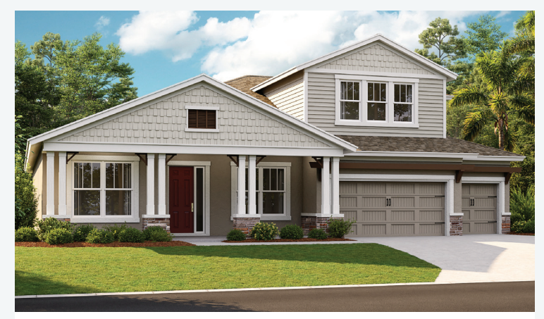
Craftsman A | CRT2