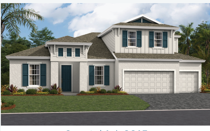
Coastal A | COA7