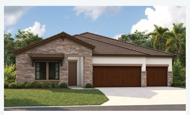
Tuscan A | TUS1