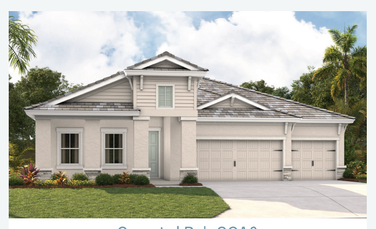
Coastal B | COA6