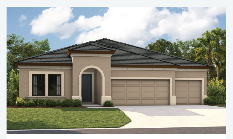
Mediterranean A | FMD8