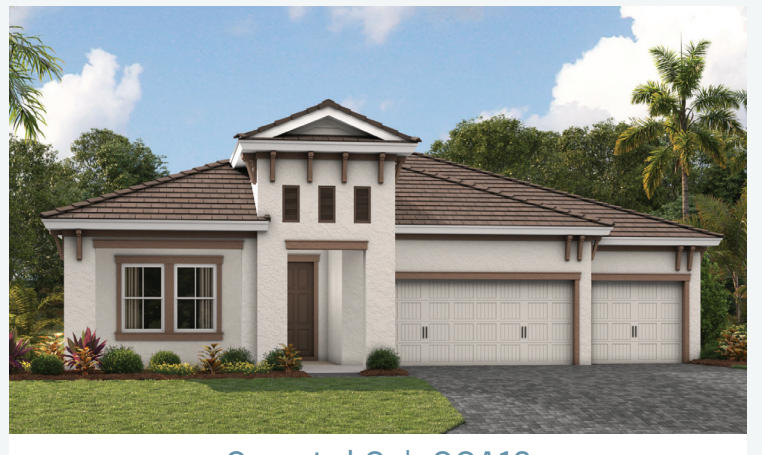
Coastal C | COA13