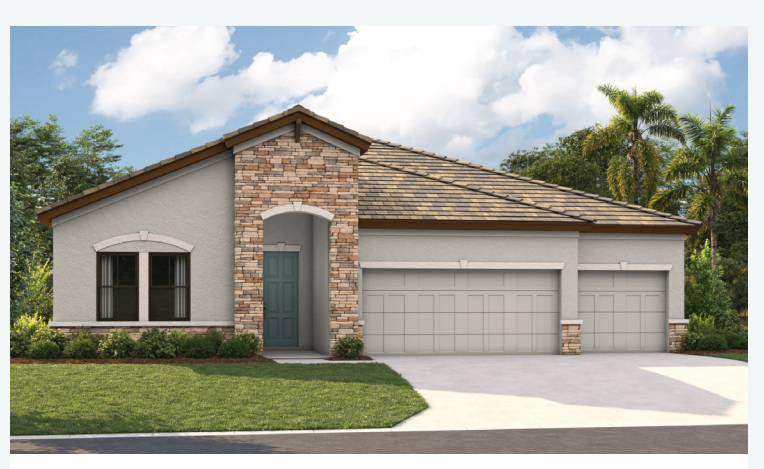
European A | EUC7