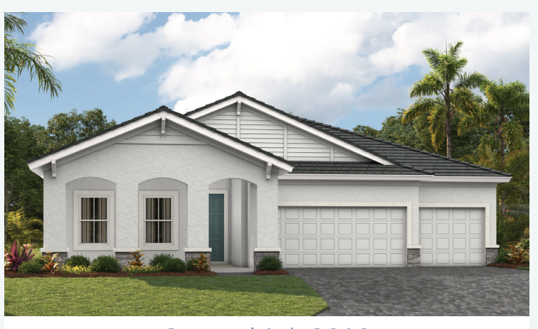
Coastal A | COA8