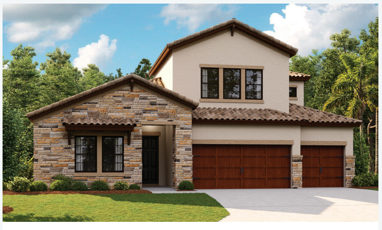
Tuscan A | TUS4