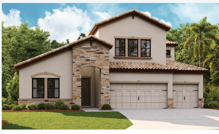
European A | EUC2