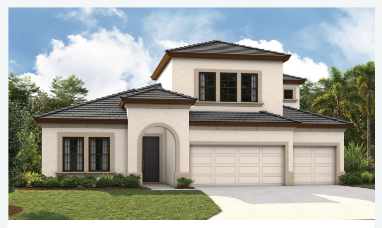
Mediterranean A | FMD3