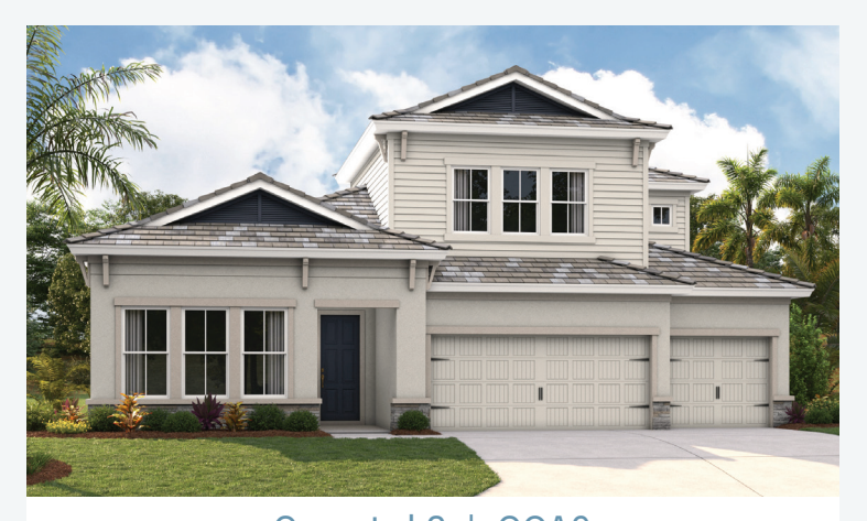
Coastal 2 | COA9