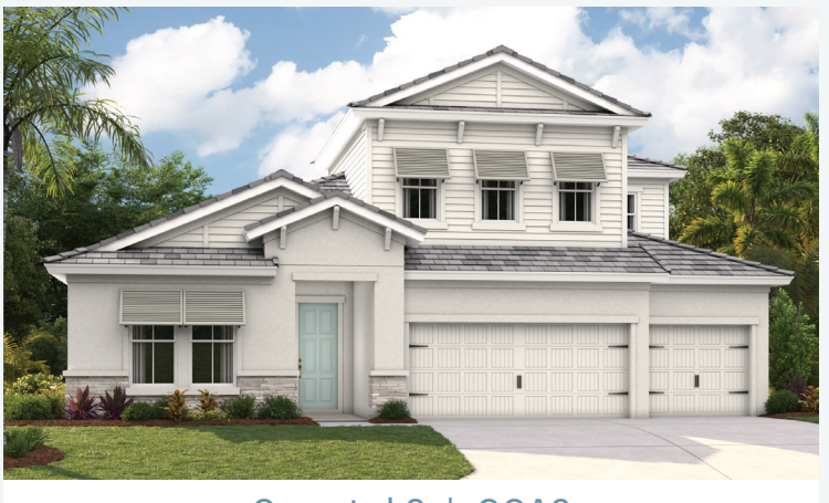
Coastal 3 | COA2