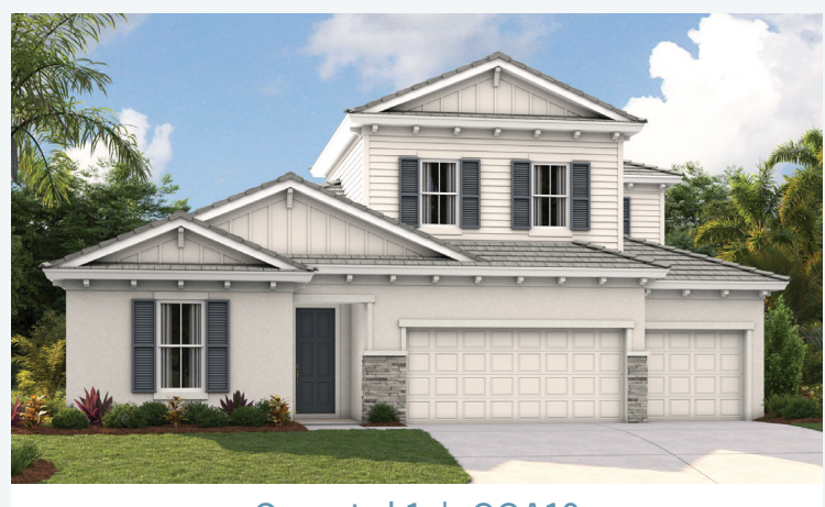
Coastal 1 | COA10