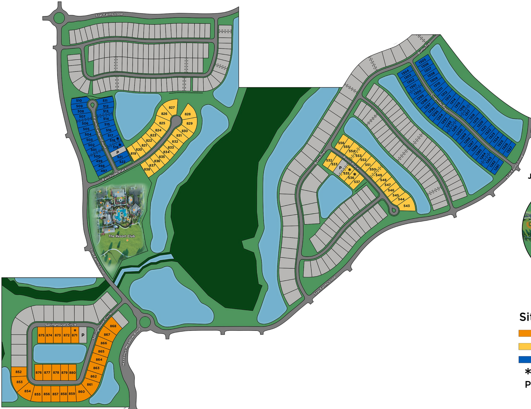
Junction Place Amenity