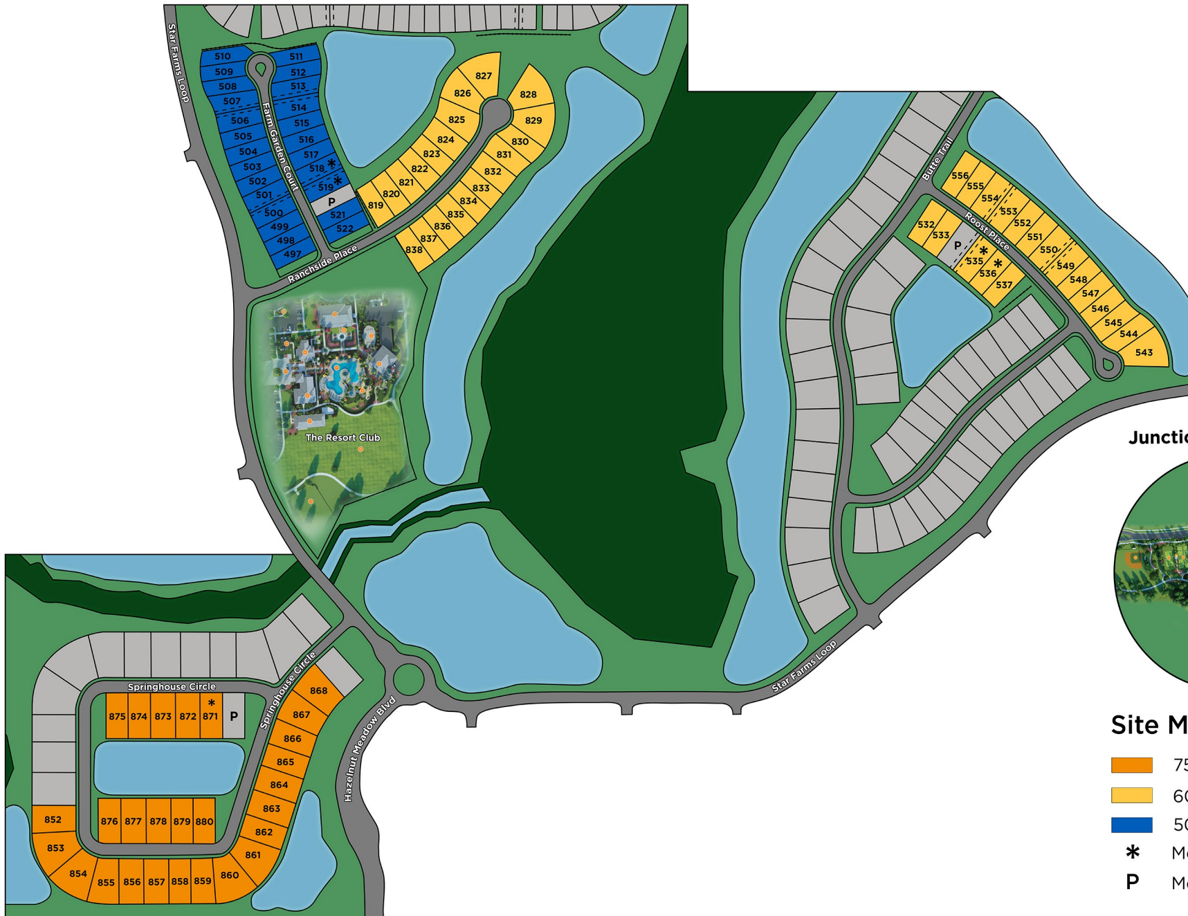
Junction Place Amenity